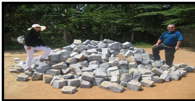
Bong Son 61 st Assault Helicopter Company Library Site