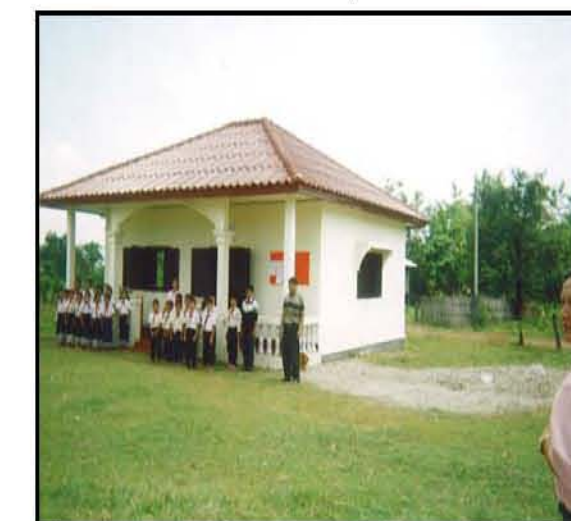
Worley/ Engelken/ Sopha/Theusch Library Small Dream #3 Dongmakhai Village, Vientiane Municipality December 16, 2006

Sponsored by: WALL-TIES & FORMS, INC. 4000 Bonner Industrial Drive Shawnee, KS 66226 USA 1-800-444-9692 Ph. 913-441-0073 Email: ask@wallties.com Web Site: www.wallties.com "Building a better world"